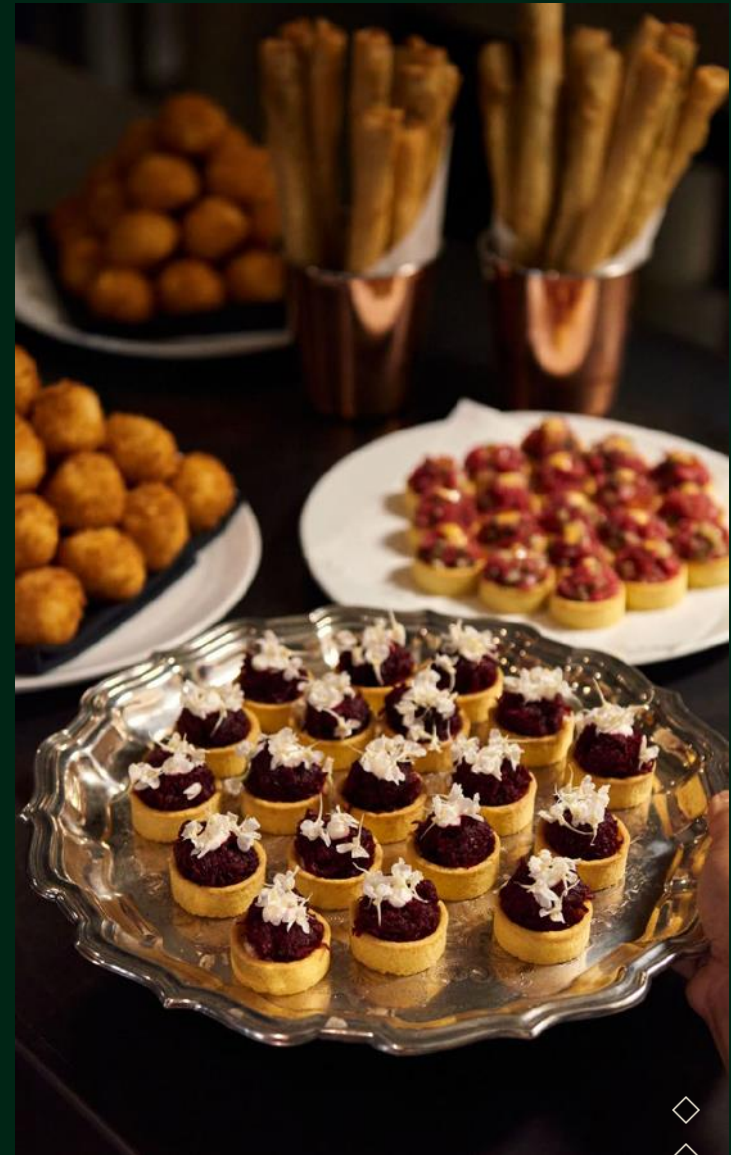
Example of canapés